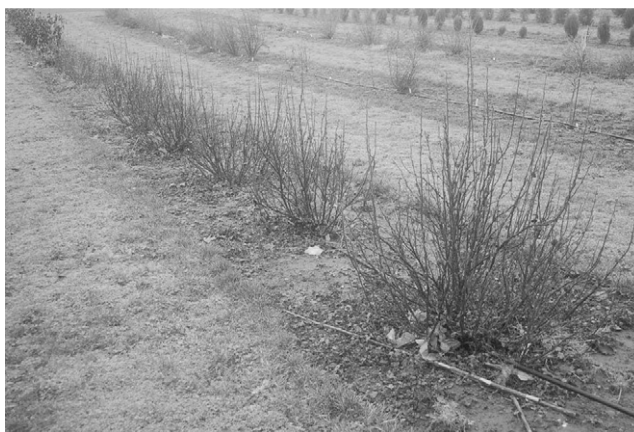
Fig. 1. Ribes sanguineum ‘Oregon Snowflake’ during winter demonstrating its dense branching. The original plant is in the foreground with five replicates planted after it, which demonstrates the consistency of growth habit in plants propagated from stem cuttings.

on its highly dissected leaf morphology while growing in a 1-L container in a glasshouse. It was propagated by stem cuttings and the resulting plants were used to establish a replicated (non-randomized) trial in 2012 as plants 13-01 (original plant), 13-02, 13-03, 13-04, 13-05, and 13-06 at the Lewis-Brown Horticultural Research Farm (Corvallis, OR) (Fig. 1). Container-grown plants were also distributed to commercial nurseries in Oregon for evaluation under Material Transfer Agreements.