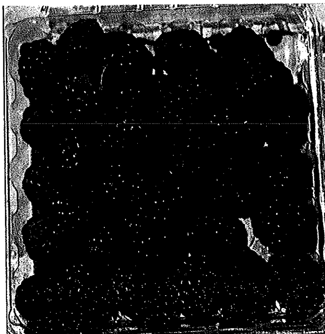
Fig. 1. 'Lewis' red raspberry.

The cultivar has been tested in Aurora, Ore. [Oregon State Univ.–North Willamette Research and Extension Center (OSU–NWREC)], Mt. Vernon [Washington State Univ. (WSU)] and Puyallup, Wash. (WSU), and various grower sites throughout New Zealand. The most thorough testing in research plots was done in the United States. From 1987 to 1992, 'Lewis' was evaluated in nonreplicated trials at OSU–NWREC including 50-m long rows that were machine harvested and the yield measured. More recent replicated trials at OSU–NWREC (planted in 1996), Mt. Vernon (planted in 1992), and Puyallup (planted in 1992), were arranged in a randomized complete-block design, with three replications of three plants each used for fresh fruit characteristics, harvest season, yield, and fruit weight. Plants were planted 1.2 m apart within plots and 2.4 m between plots. The yields in the Mt. Vernon planting were unusually large for all cultivars. The replicated trial in Aurora, Ore., was not planted on raised beds and the planting in general suffered heavily from Phytophthora root rot (caused by Phytophthora fragariae var. rubi Wilcox and Duncan). During the harvest season, fruit were harvested one to two times each week depending on the environmental conditions. Fruit weight data for a season was obtained from the weight of a randomly selected subsample of 25 fruit at each harvest. Annual average fruit weight was calculated from these measurements after adjusting for the proportion of the