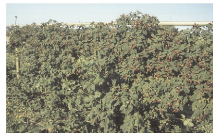
Fig. 1. Plants of ‘Onyx’.