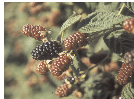
Fig. 2. Ripe fruit on plants of ‘Onyx’.

Received for publication 4 Jan. 2011. Accepted for publication 24 Jan. 2011.