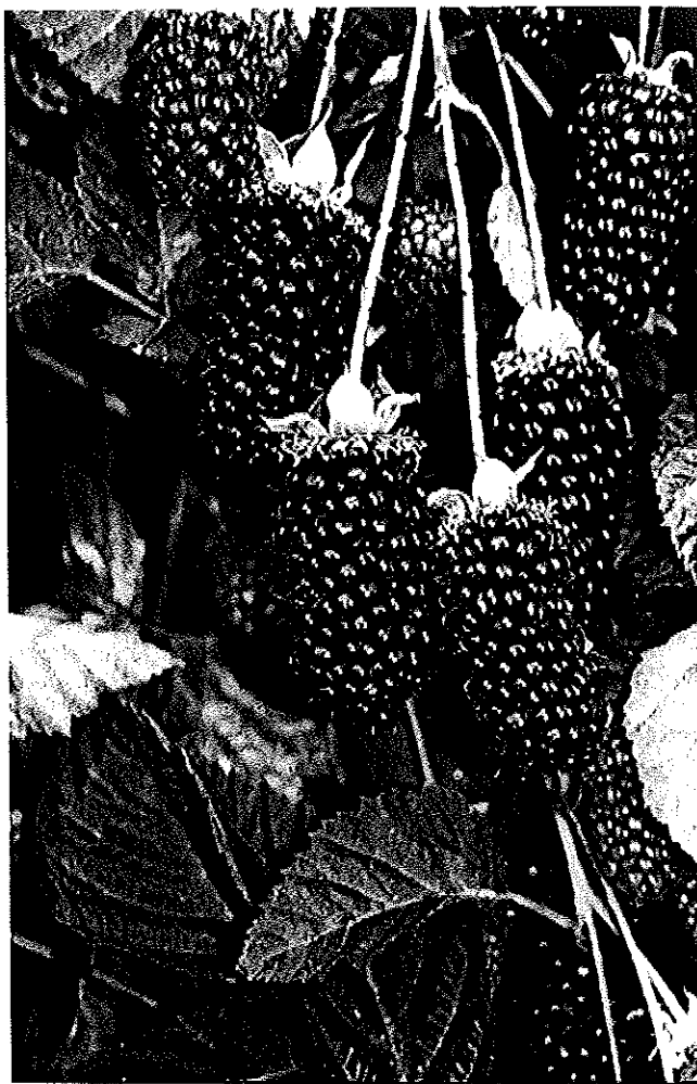
Fig. 2. 'Siskiyou' blackberries.

* Mean separation within columns by Duncan's multiple range test, P \leq 0.05 .