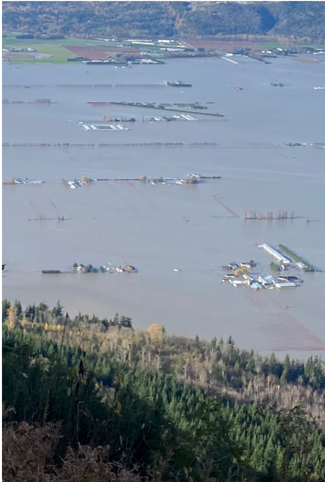
Figure 2. Aerial photo of completely submerged mature blueberry plantings in the Sumas Flats.