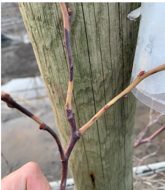
Figure 5. Shoot tissue necrosis in response to extremely severe flooding conditions in the Sumas Flats.

structure. Organic matter inputs can feed aerobic microbes that then turn part of this carbon into sticky substances that promote aggregation. Not all composts are appropriate for blueberries, and qualities such as liming potential and salt content should be considered ( http://whatcom.wsu.edu/wam/apr15_s2.html ). Additionally, field traffic and tillage should be avoided when the soil is too wet (i.e., above field capacity). It is also important to note that the time scale over which these practices are expected to alter soil structure or provide preferential flow pathways for water varies considerably, with subsoiling having a more immediate short-term impact, organic amendments having a slow and longer-term impact, and cover cropping likely in the middle.