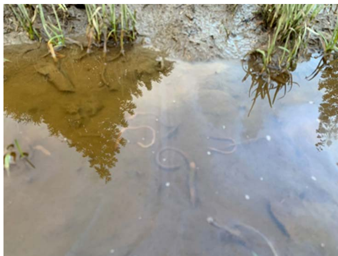
Figure 4. Dead earthworms in a puddle after three weeks of soil inundation.

The primary concern is that soil structure has been severely impacted and that this will result in a lasting challenge to the root systems of plantings that experienced the most severe flooding. As outlined in the previous report, flooding can have a negative impact on soil structure. Flooding breaks down large aggregates and silt or clay particles suspended in water can clog soil pores as the water recedes. This may reduce the mean pore size and pore connectivity in the soil,