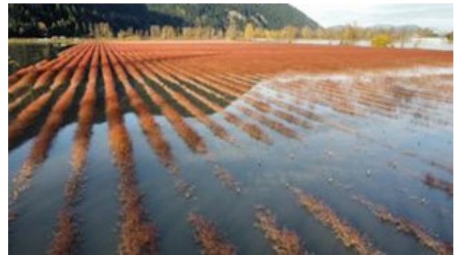
Figure 3. Aerial photos of flooding in the Sumas Flats. A and B. Completely submerged mature plantings experiencing extreme severity flooding conditions, C and D. Partially submerged mature blueberry plantings experiencing high severity flooding conditions.