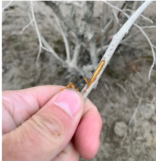
Figure 6. Shoot damage in response to extremely severe flooding conditions in the Sumas Flats. A. Dead floral buds (note vascular tissue on removed bud at third node), B. Dead vascular cambium on new shoot.

Below, we discuss management options, but the compounding effect of biotic challenges to plants that have already been weakened by abiotic stresses should provide growers with an additional reason to prune hard. Aside from the removal of crop load and stimulation of root regrowth mentioned in the previous report, removing damaged shoots through pruning will reduce the risk of severe disease infection.